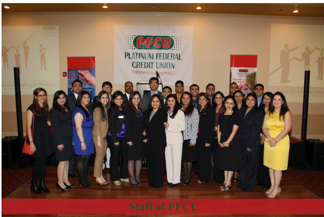
Staff of PFCU