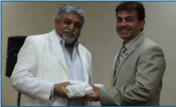
1st RSVP Winner for iPad mini