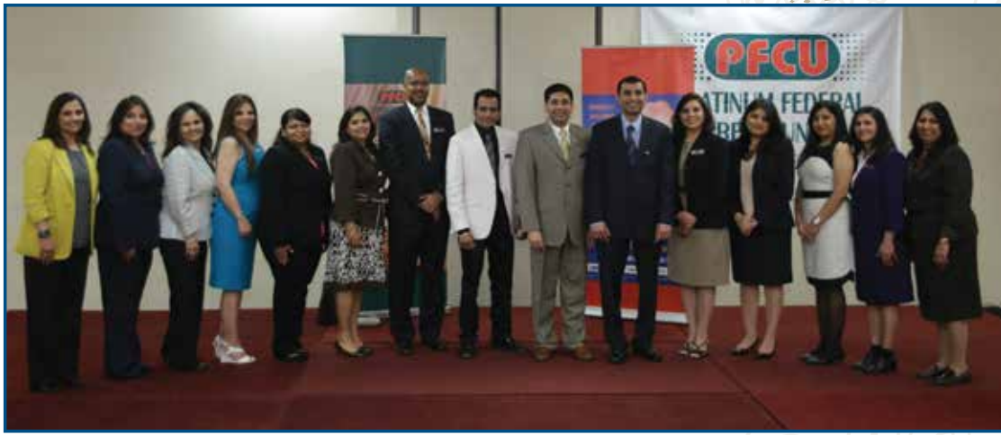
PFCU Staff Members