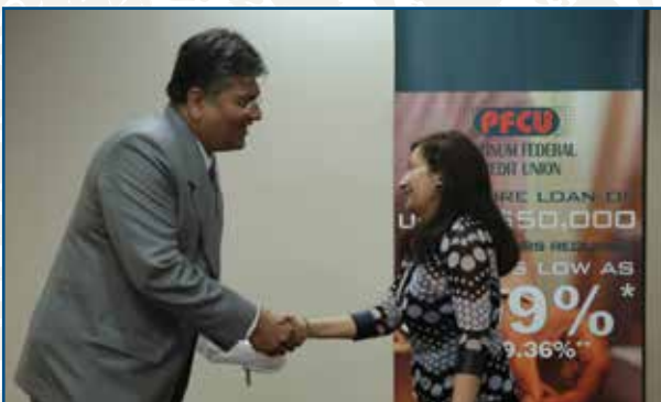
3rd RSVP Winner for iPad mini