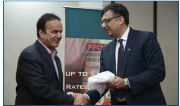
2nd RSVP Winner for iPad mini